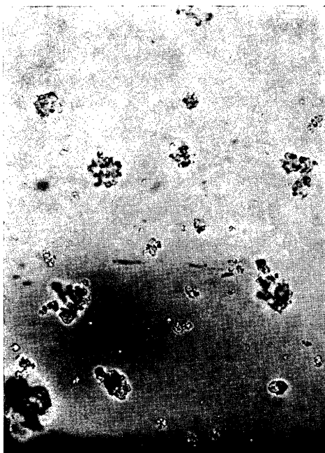
Fig. 1. Crystalline \beta -glucuronidase ( \times 400 ).

The pH is adjusted to 7.8 and the enzyme comes down first on addition of ammonium sulphate. Twice crystallized the activity was about 1.3-1.7 \times 10^5 Units per mg, A_{290} for 1 mg per ml is 1.4. When the crystals are dissolved in water and dialyzed against distilled water the enzyme crystallizes, see Fig. 1.